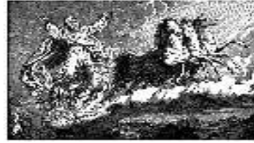
Taken up in Fiery Chariot