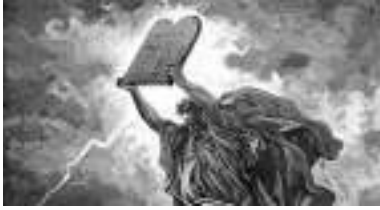
Buried by God